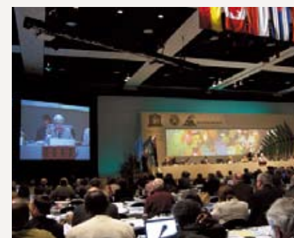
World Heritage Committee (Christchurch, New Zealand, 2007)